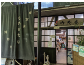
Tokyo Somemonogatari Museum

Tsumami-kanzashi are decorative hair ornaments created out of small pieces of silk cloth. The dyeing works in Tokyo has incorporated a modern sensibility with stylish tradition. Kigumi is traditional craftsmanship used in Japanese architecture.