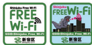
Free Wi-Fi Area sign

~Shinjuku City Public wireless LAN service~